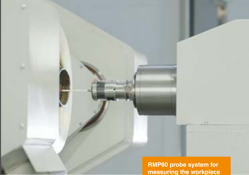
RMP60 probe system for measuring the workpiece