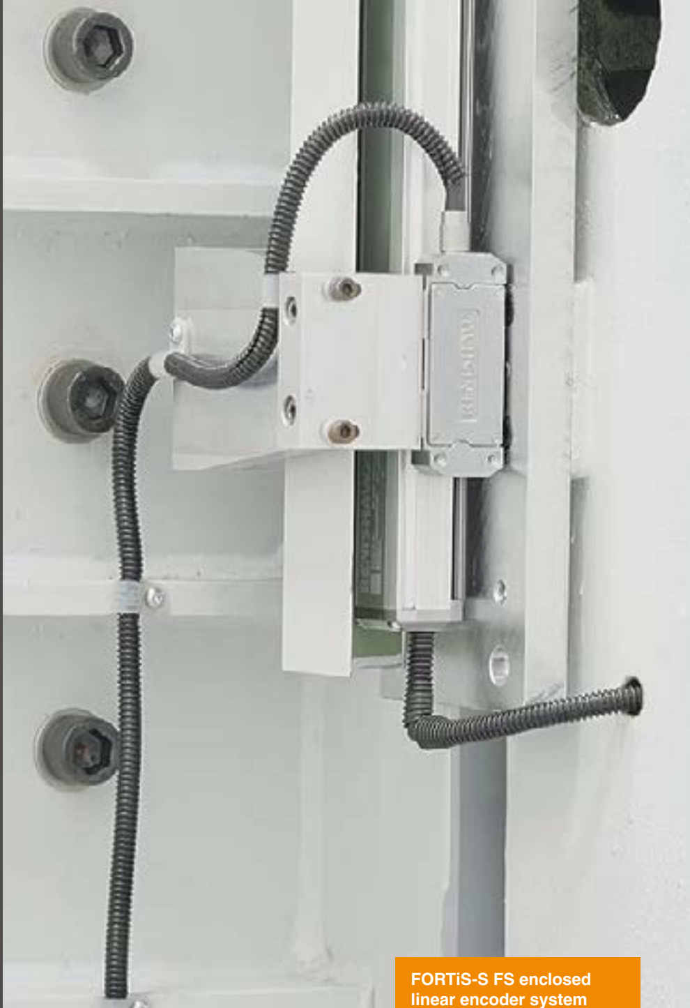
FORTiS-S FS enclosed linear encoder system

The basic machine design comprises a holder for a workpiece, a spindle for milling and grinding the workpiece, and a rotatable tool turret. A trunnion table supports the build plate and provides the 4th and 5th axes of the machine.