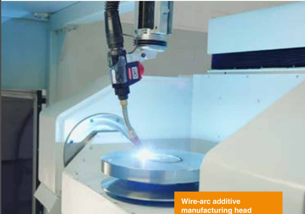
Wire-arc additive manufacturing head

The team at Effective CNC has designed and built an ‘all-in-one’ machine that can perform both additive and subtractive machining operations in tandem. This, they claim, will help to revolutionise the economics of many large, precision AM metal builds.